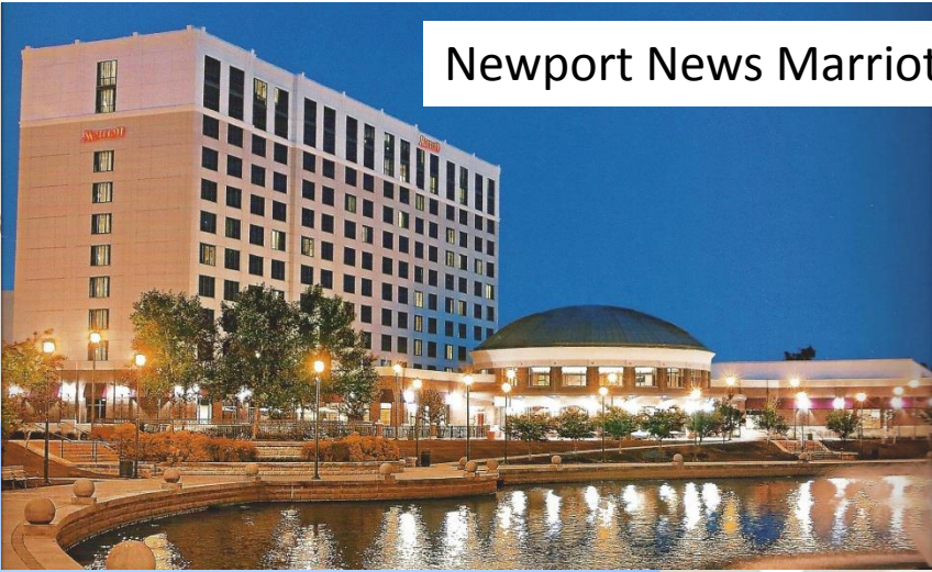
Newport News Marriott at City Center,